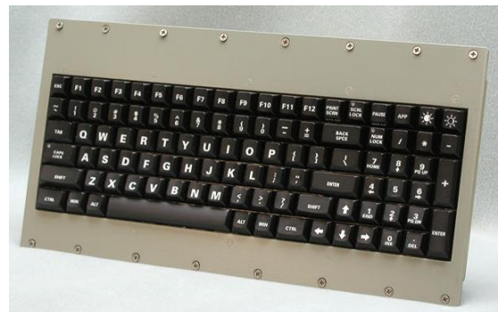
Panel Mount Model 90 without pointing device