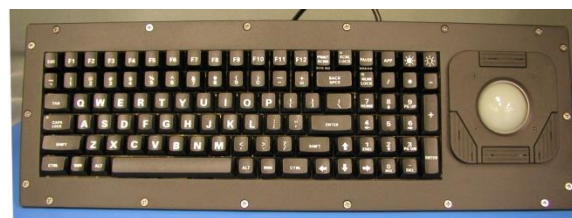
Panel Mount Model 90 with 2" DuraTrackball