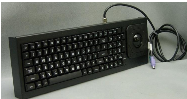
Table Top Model 90 with 2" DuraTrack Trackball

Many options and configurations are available – mounting options include table top (with or without feet for bolt down applications) or mounting flange for top panel installation. The Model 90 can be ordered with or without an integral pointing device and/or USB hub for easy integration into your host system.