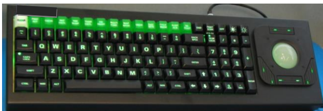
Table Top Model 90 with custom keys and 2" DuraTrackball

Sealed rain proof, spill proof/sand and dust proof (IP65 and MIL-STD-810) construction EMI/RFI/ESD/EMP shielded and protected for critical applications Optional Extreme High Shock Protection (+100gs): Includes shock sensing (Stop Codes) and keycap clips as well as other options